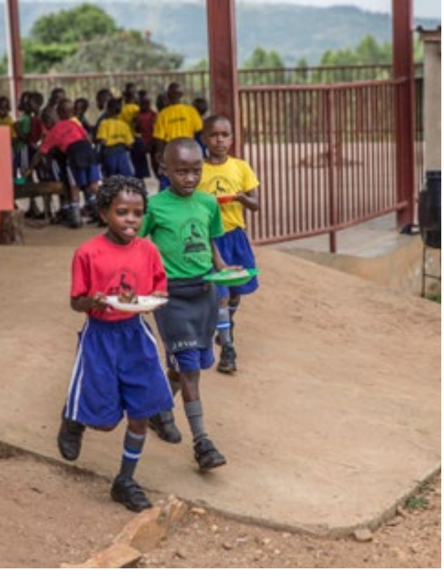
300+ students were provided with free malaria treatment in 2019-20 (which costs 1 to 4 times the average guardian's monthly wage). Qualitative evidence also showed visibly increased wellbeing due to our feeding program (3 meals daily).